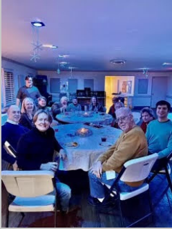
AGO's Twelfth Night Party